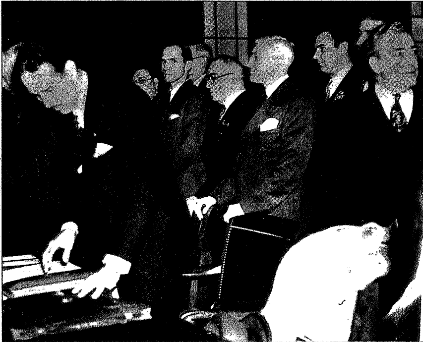
Bruno Richard Hauptmann, in the center looking at the camera, during an extradition hearing in the Bronx.

Your wife is being held in the Women's jail with a lot of prostitutes. She is separated from your baby. It has no one who loves it, to take care of it. It may die of undernourishment. Your wife is hysterical. She will probably become an imbecile over